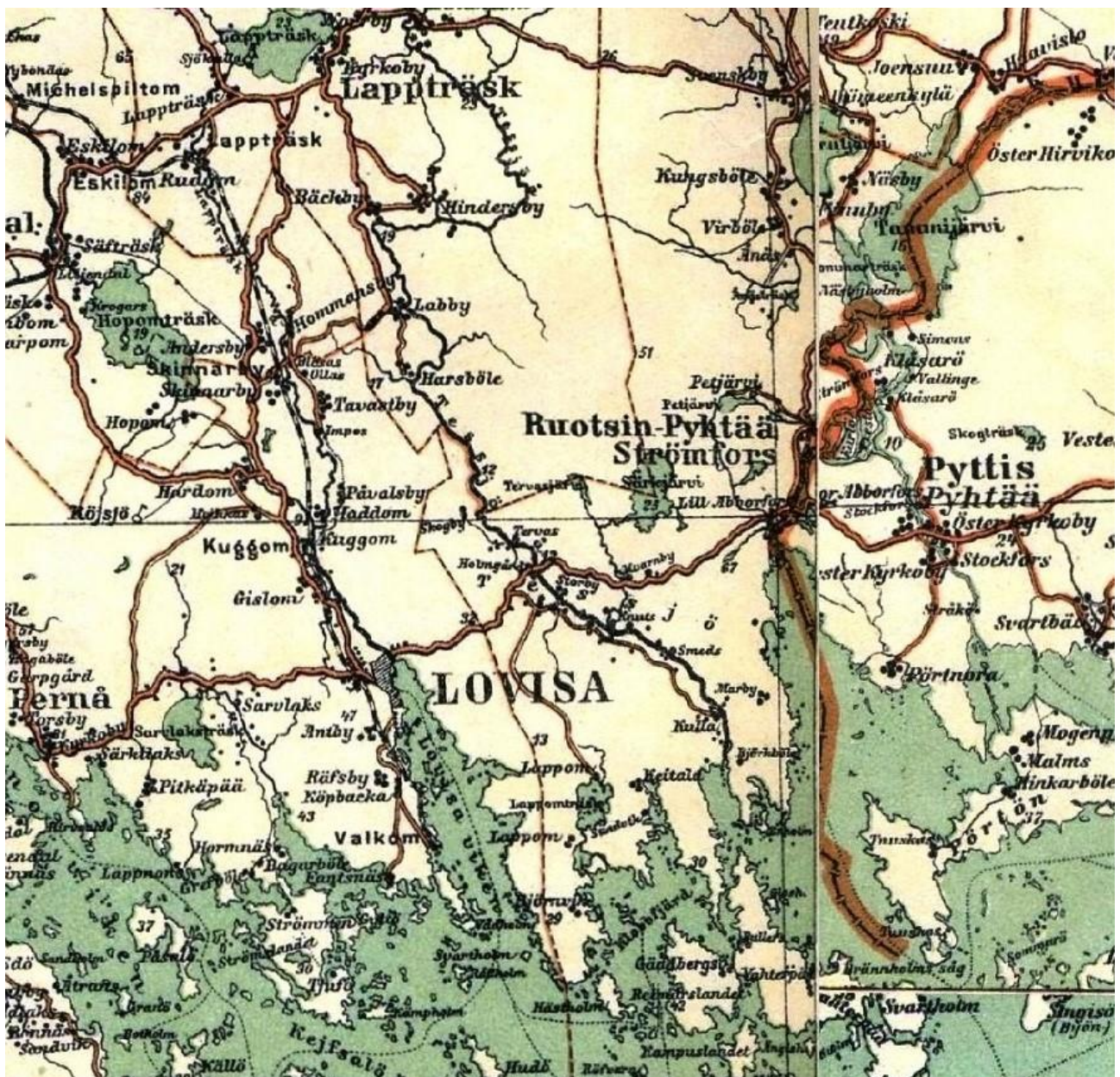
Loviisa – Pyhtää – Ruotsinpyhtää region.

A heritable surname system has been in use in Eastern Finland for centuries. In Western Finland surnames were not in common use before the early 1900s. People there generally used additional names that referred to the place of residence. After the new name laws in 1921, surnames became mandatory everywhere. Also before the 1900s people generally used patronymic names (e.g. Kustaanpoika = Kustaa's son, Kustaantytär = Kustaa's daughter).